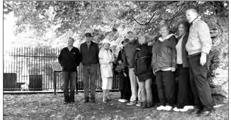
Above left is the entrance to Middletown's Russell Library. Above right are the intrepid cemetery sloggers next to Founders' Rock outside Riverside Cemetery, burial place of early Middletown settlers. At lower left is the Connecticut State Library – although genealogists are more familiar with the back door!

greeted at the Marriott Residence Inn in Cromwell, Conn., where enthusiasm bubbled for the 6-9 p.m. research night at Godfrey Memorial Library in Middletown. In between spurts of research at Godfrey, SMFSD "cousins" reconnected and new friendships were forged.