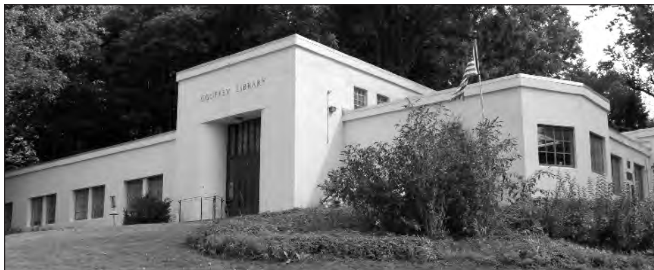
Godfrey Memorial Library – our first destination on Friday, Aug. 18.

Friday, Aug. 18. With some attendees arriving on Thursday evening, registration and greeting began at 10 a.m. at the hotel. At 11 a.m. the group proceeded to Godfrey