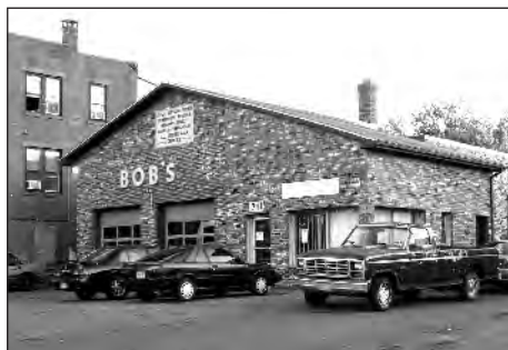
"Hey! That's not Ggggg-Grandpa's house!" Main Street, Middletown.