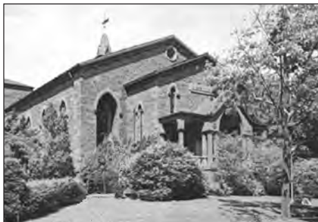
Middletown's Russell Library – our second research destination on Friday, Aug. 18.