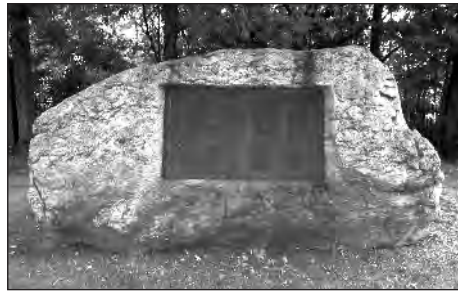
Founders Rock, located at the entrance to Riverside Cemetery in Middletown.