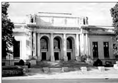
The Connecticut State Library at the Supreme Court Bldg. in Hartford – our first research destination on Saturday, Aug. 19.

holdings, which in addition to books and publications on local history, includes maps, a clippings & ephemera file, and the work of local historians of the past. Russell Library also has Middletown newspapers, early property records, and early vital records on microfilm – with a reader connected to a laser printer for efficient copying.