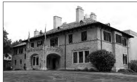
The Connecticut Historical Society in Hartford, Conn. – our second research destination on Saturday, Aug. 19.