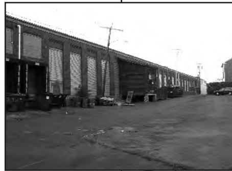
"Hey, that's not Ggggg-Grandpa's cider mill!"